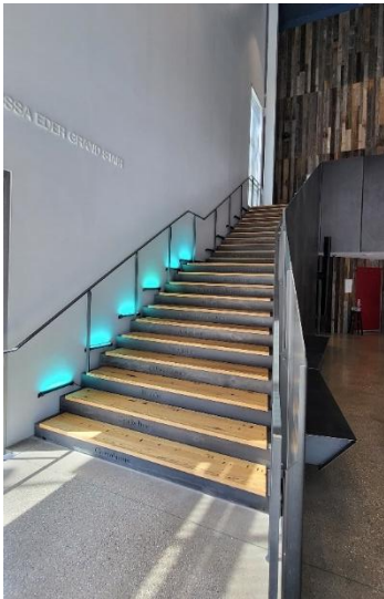
Staircase in lobby

I can also access the second floor by accessing the elevator. The elevator is down the hallway located on the right side of the Box Office.