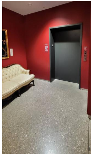
Elevator to second floor