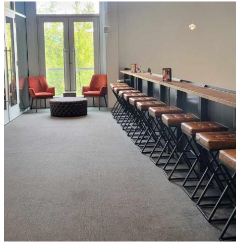
Second Floor Quiet Area