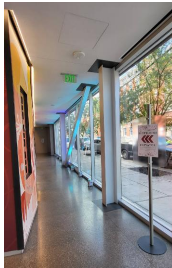
Hallway to access elevator