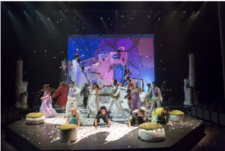
Actors on stage

People in the audience may laugh, clap, or gasp during the show. I can do this too if I want!