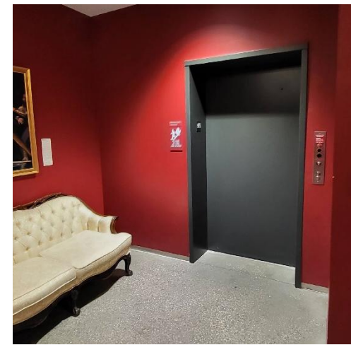
Elevator to Second Floor