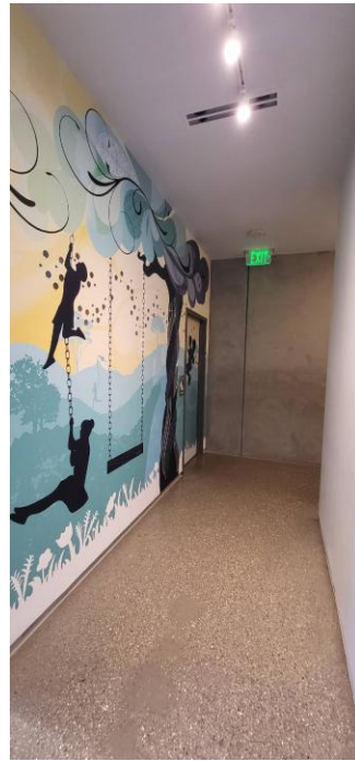
Women's restroom is down the hall