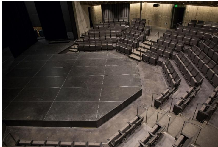
Inside the theatre

I may have to ask people to let me through the aisle. This is okay.