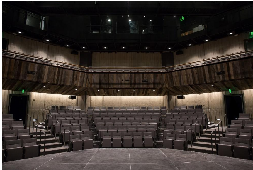
Inside the theatre

They will be marked with green exit signs.