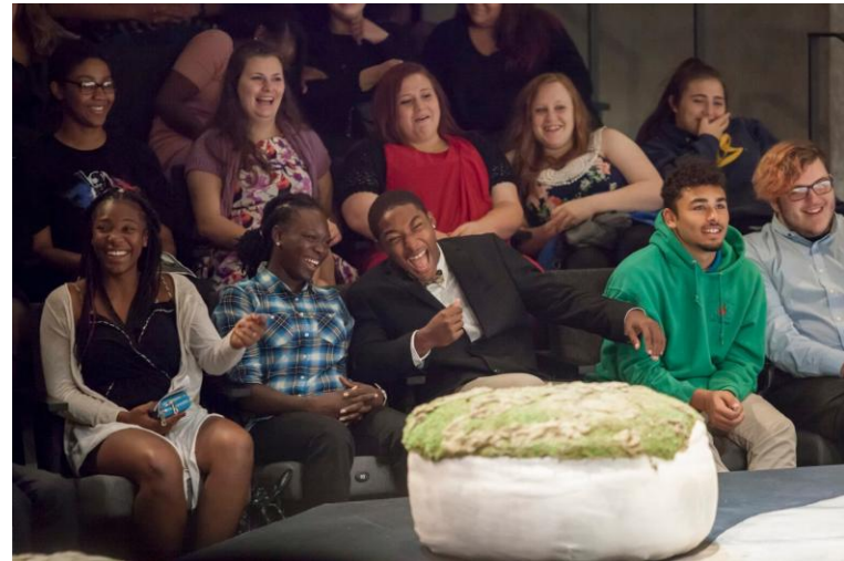
People watching show