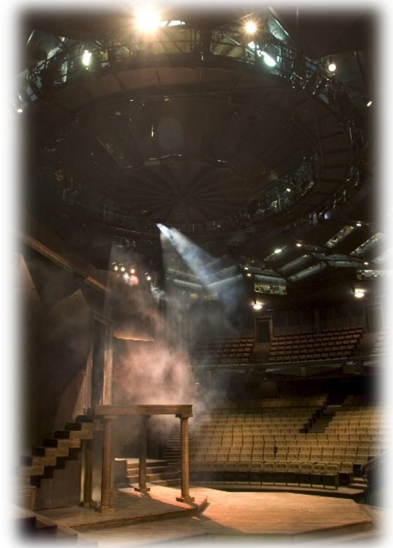
Festival Theatre

“For me, the trip was an intellectual, emotional, and social feast. Spending a week with a dozen people I did not know particularly well, but sharing with those people a love for theatre, history, learning, and travel, has left me more revitalized than any vacation I have taken in a very, very long time.”